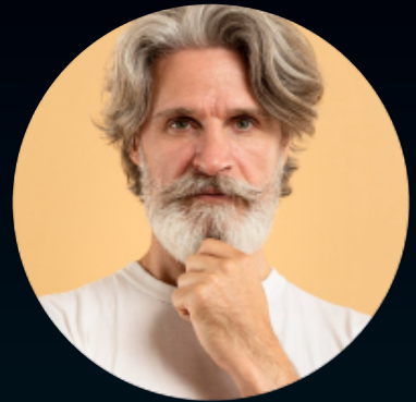
Neo Product Manager